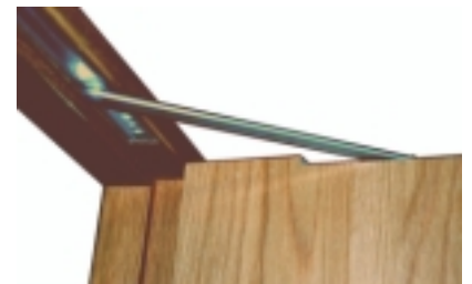
Only Visible when Door is Open