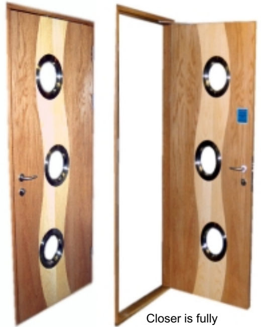
Closer is fully concealed in door

A 3 year guarantee with free replacement ex-works of any closer proved defective by reason either of faulty manufacture or defect in materials.