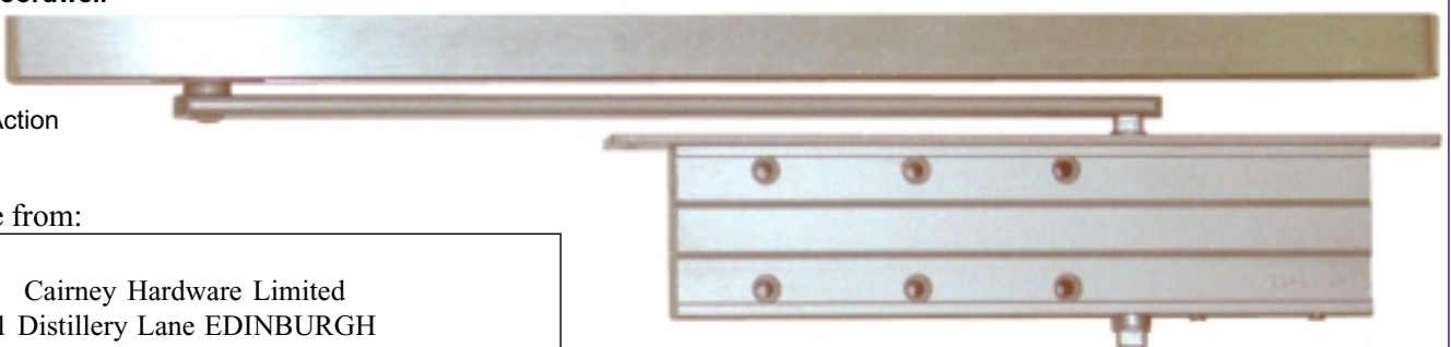
C2303 Door Closer, Arm & Track

Wall or Floor Mounted Delayed Action Device