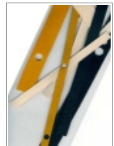
C2INT Intumescent Pack for up to 1 Hour Fire Door