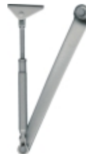
C23F1 Surface Standard Arm, closer & cover